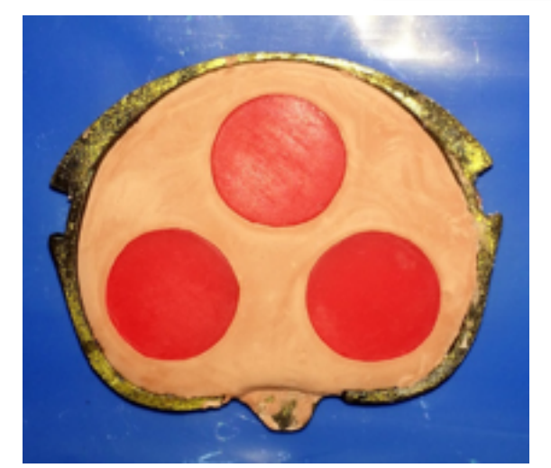
Figure 1. Wax pattern for porosity test

Once the stone has set, the upper half was coated with a Vaseline and positioned over the lower half and filled with dental stone. After one hour, the flask was