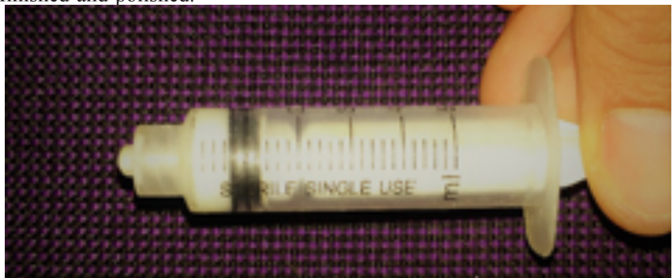
Figure 3. Percentage of titanium dioxide filler

The oil paint (TiO2) in concentration of 1 ml was added using a syringe to 9 ml of monomer and then mixed with acrylic powder (22 g) (Figure 3).