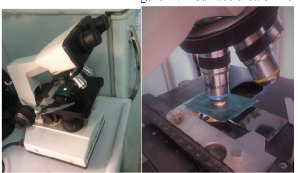
Figure 5.Testing the specimens with optical microscopic