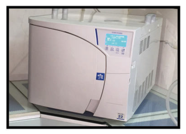
Figure (3) Autoclave