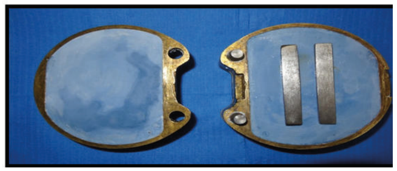
Figure (1) Metal pattern for transverse strength and surface roughness test in dental flask

The stages of operation of autoclaves included air removal, steam admission and sterilization cycle including heating up, holding/exposure, and cooling stages.<sup>(27,28)</sup>The autoclave was operated to start heating the water, then the temperature and pressure were raised till they reached (121°C & 210 Kilopascal) respectively. When the temperature reached (121 °C), the temperature and pressure were held automatically at (121 °C and 210 KPa respectively for15 minute for short curing cycle and for 30 minutes for long curing cycle, then automatically exhausted the steam and the programmed cycle was finished. Finally, the metal flask was allowed to cool at room temperature for 30min., followed by complete cooling of the metal flask with tap water for 15 min. before deflasking. The acrylic patterns were then removed from stone mold. (4)