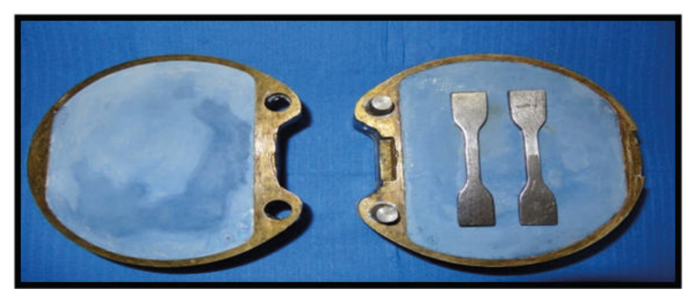
Figure (2) Metal pattern for tensile strength test in dental flask