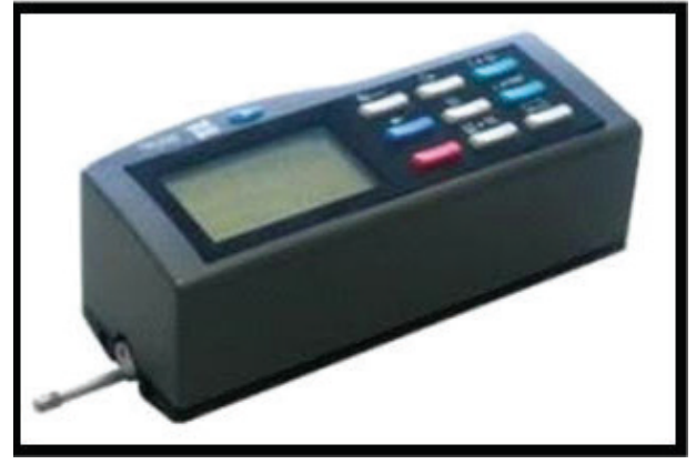
Figure (6) Digital profilometer device for surface roughness test