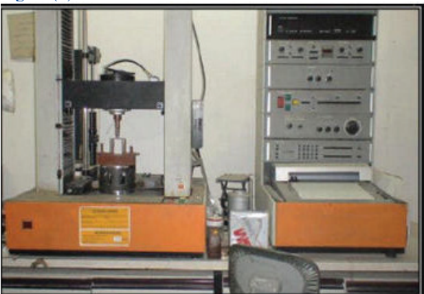
Figure (4) Instron testing machine for transverse strength test

The test was carried out by using the instron testing machine with grips suitable for the test specimens (Figure 5) and the load was applied with cross head speed of 1mm/min. The specimens were tested with a full scale load of 50kg.